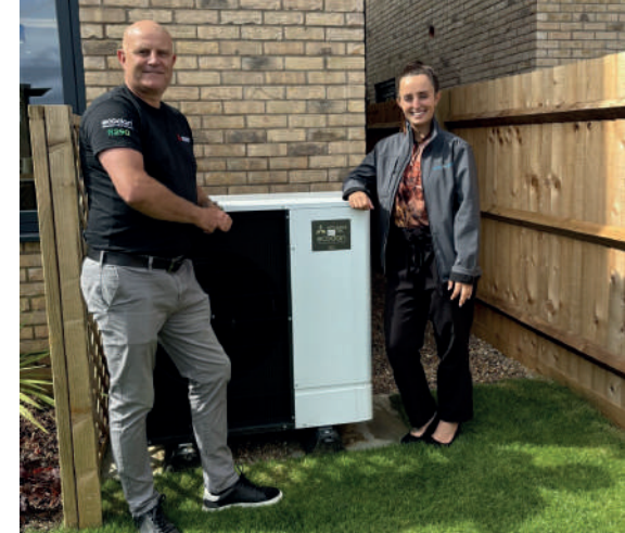
Photos: Grace Homes were joined by GivEnergy and Mitsubishi Electric Heating UK at Hanwood Park