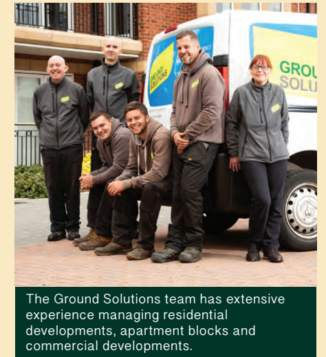
The Ground Solutions team has extensive experience managing residential developments, apartment blocks and commercial developments.