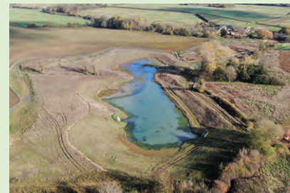
Aerial view of the attenuation pond, taken in 2021, soon after installation

The pond will be an attractive feature for people to visit, but there is still much work to be done in the area surrounding it, including tree, woodland and wildflower meadow planting and the installation of footpaths, a boardwalk and a naturalistic play space. Public access to the area is not yet permitted, whilst we give the natural landscape sufficient opportunity to re-establish. In the meantime, the pond has already been attracting waterfowl – including ducks, geese and swans. Planting along the banks of the pond is designed to provide shelter and habitat for a variety of species so we're looking forward to welcoming an even wider variety of visitors to the area in the coming months.