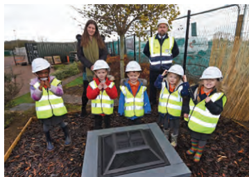
Children admire their new fire pit area

Bellway have partnered with Hayfield Cross Church of England School, where they have significantly enhanced the children's outdoor playing area. Play areas created and donated by Bellway will improve the children's learning experience and can be used throughout the year. www.bellway.co.uk/new-homes/northern-home-counties/bellway-at-hanwood-park