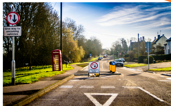
New traffic calming measures in Cranford