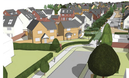
Images: David Wilson/Barratt Homes development